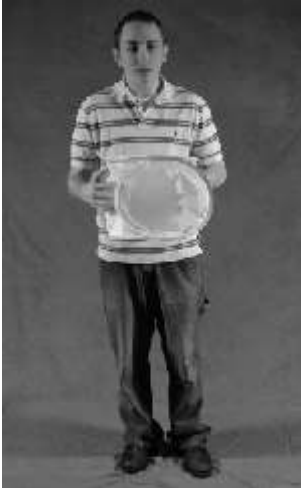
1. Work from behind the tent.