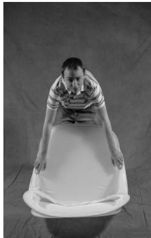
2. Fold the top of the tent down and tuck front edge into the bottom corner.