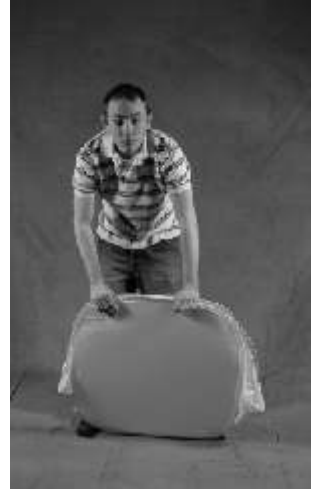
4. Grasp the outside edges of the folded tent.