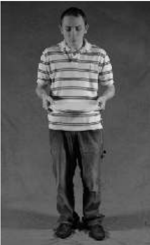
5. Fold the back panel down together forming a flat package.