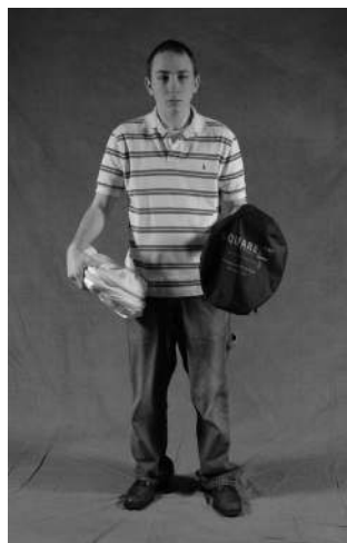
10. The folded tent will easily fit into the storage case.