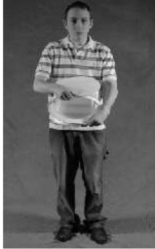
2. Fold the top of the tent down.