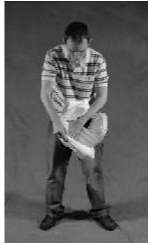
7. Tuck the half loop into the center.