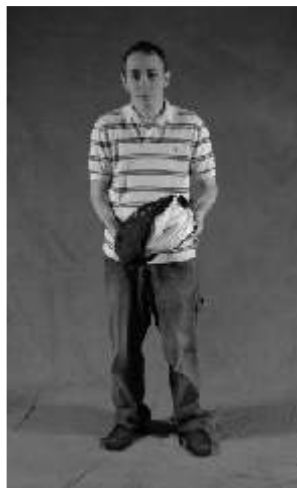
11. Done! Approximate folding time 30 seconds.