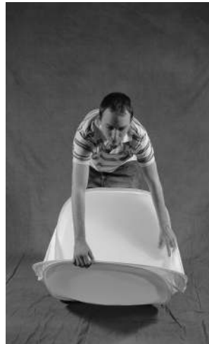
3. Pull the front bottom edge up to the back top edge.