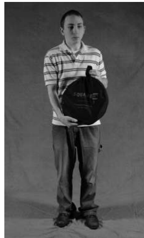
7. Down! Approximate fold time 10 seconds.