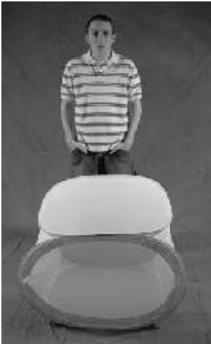
1. Stand behind the tent.