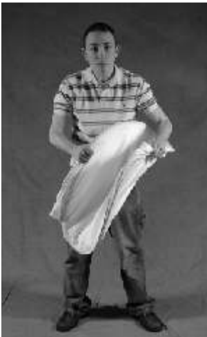
5. Fold the outer edges together forming a half.