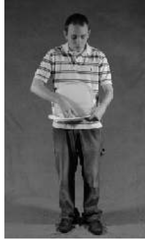
3. Tuck the front top edge into the bottom rear.