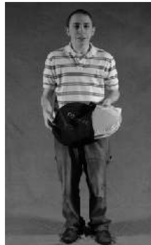
6. Slide the flattened tent into the storage bag.