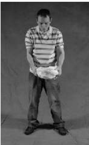
9. Your tent is now folded in a flat package.