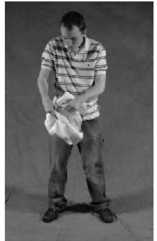
8. Twist the new formed loops and fold into a flat package.