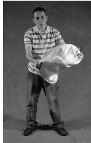
6. With one hand, hold the two edges and grasp the half loop with your free hand.