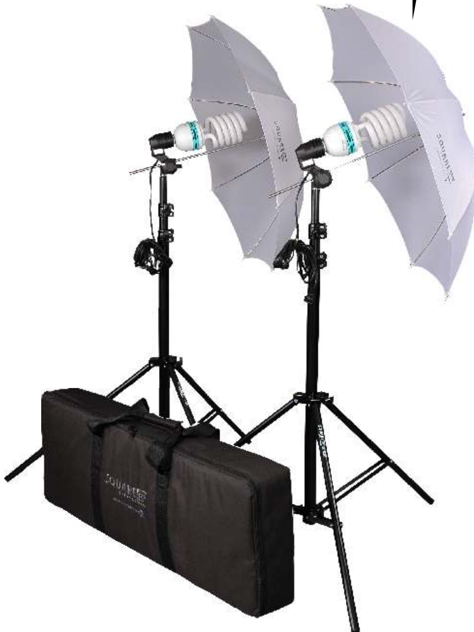
SP Umbrella Light Kit